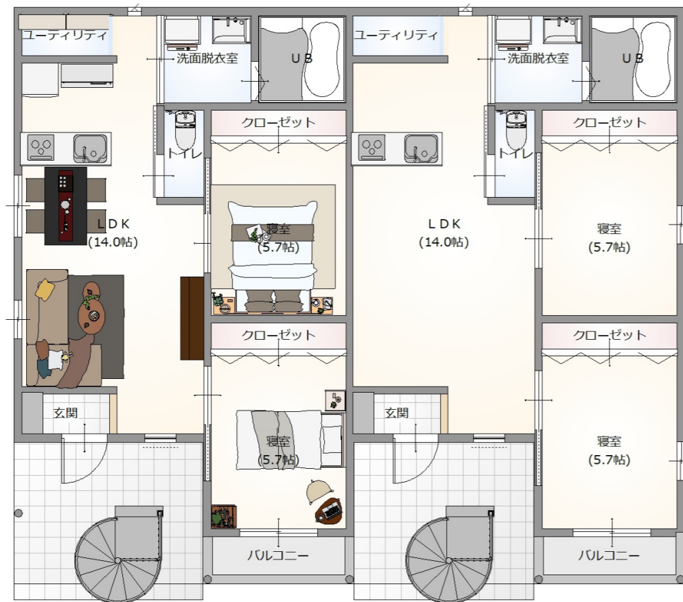
1st FLOOR S:1/100